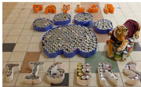
BEST MEAL CAN You Be a Tiger? Taylor Elementary