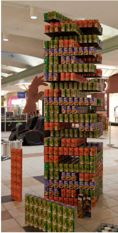
STRUCTURAL INGENUITY CANga OPN Architects