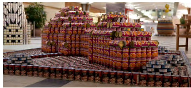
PEOPLE'S CHOICE AND HONORABLE MENTION It's Not a Hippopotamus, It's a Little HELPFROMALLOFUS Shive-Hattery Architecture Engineering