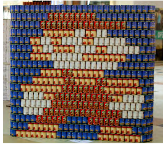
JUROR'S FAVORITE Super Mario CANS Rohrbach Associates