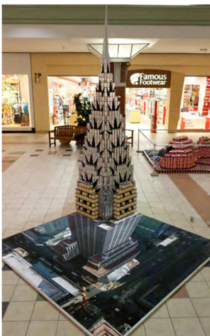
BEST USE OF LABELS CANscraper Neumann- Monson Architects