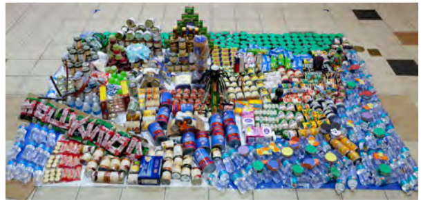
MOST CREATIVE AmeriCANa College Community Elementary TAG students