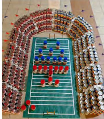
BEST USE OF LABELS We CAN Defeat Hunger in the Soup Bowl North Central Junior High