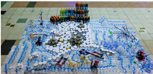
HONORABLE MENTION AmeriCANa Pacific Prairie Creek Intermediate