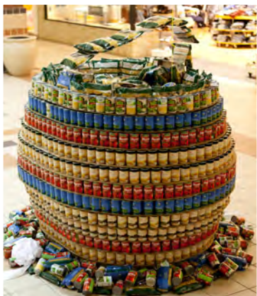
STRUCTURAL INGENUITY Easter CANasket Christ Episcopal Church