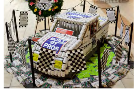
PEOPLE'S CHOICE AND MOST UNIQUE Winning the Race Against Hunger Center Point Urbana Middle School