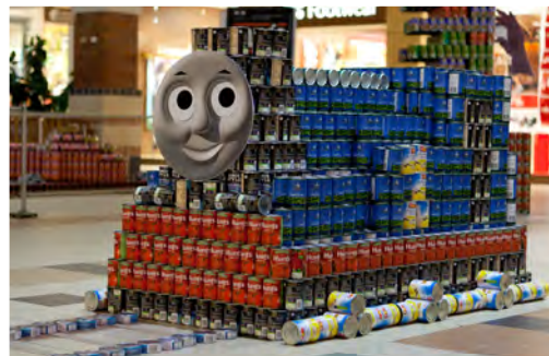
BEST MEAL The Trainers Heery International/Pigott Inc.

Visit WWW.CORRIDORCANSTRUCTION.ORG to learn more about how you can be a part of Corridor Canstruction 2012!