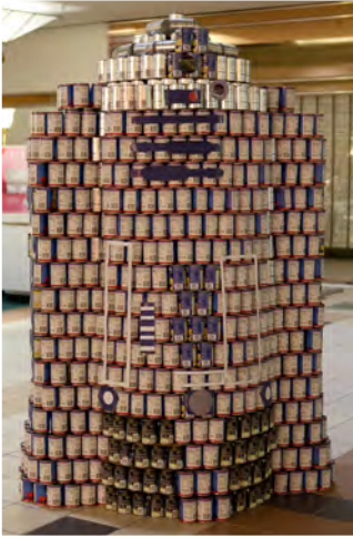
BEST IN SHOW Star Wars, CAN Wars South East Junior High