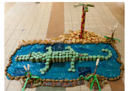
HONORABLE MENTION Gators CAN do CRCS Viola Gibson Elementary

Visit WWW.CORRIDORCANSTRUCTION.ORG to learn more about how you can be a part of Corridor Canstruction 2012!